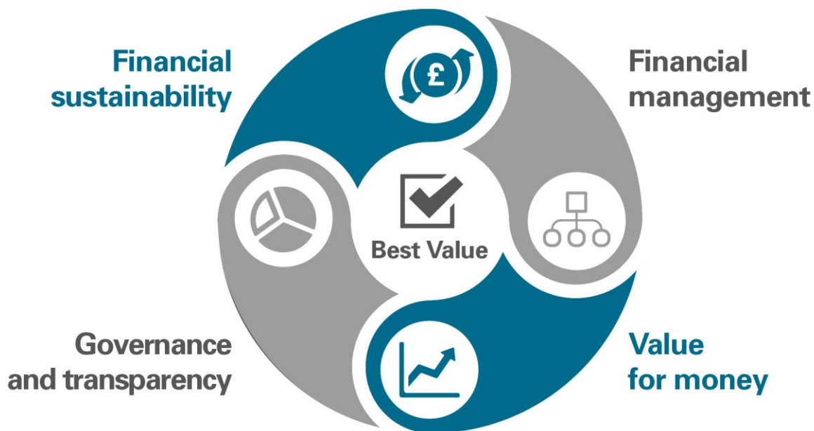
Exhibit 4 Audit dimensions

24. The four dimensions that frame our audit work are shown in Exhibit 4 .